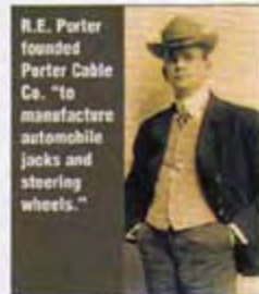
R.E. Porter founded Porter Cable Co. "to manufacture automobile jacks and steering wheels."

Safety First: Learning how to operate power and hand tools is essential for developing safe woodworking practices. For purposes of clarity, necessary guards have been removed from equipment shown in our magazine. We in no way recommend using this equipment without safety guards and urge readers to strictly follow manufacturers' instructions and safety precautions.