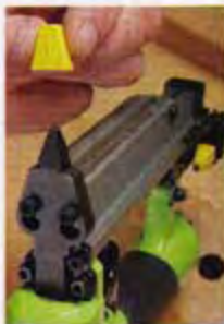
GREX outfits the P635 with a removable protective nose tip to cushion its blows.